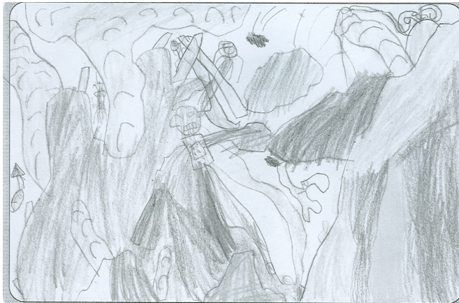
Pencil drawing by Alex