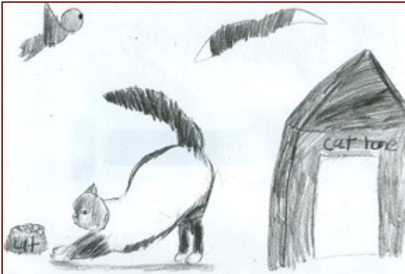
▼ Drawing by Hanbi Kim, age 6, Mountain View Elementary